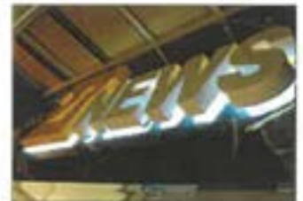
Pictured above: ABC27 News Studio in the York Galleria Mall.

The studio had a specially designed storefront system created by ABC27, eciConstruction, and the York Galleria's design architect.